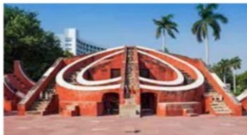
JANTAR MANTAR- A scientific masterpiece of India